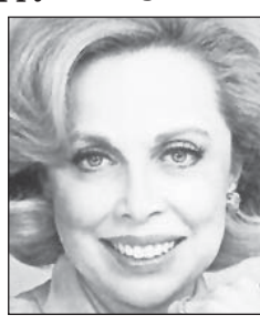
DR. JOYCE BROTHERS